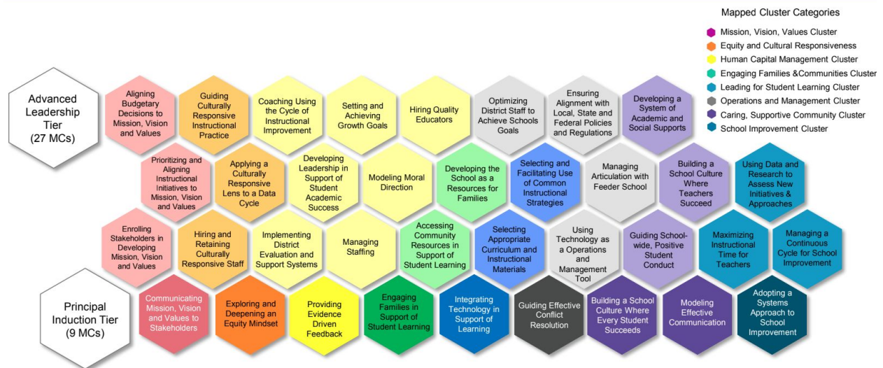
An example of a micro-credential pathway in BloomBoard

Learners can also be guided in how to appropriately engage with content through automated platform mechanisms. Brightspace and edX, for example, provide the functionality to “unlock” content to ensure that learners follow a particular sequence; these release conditions are set by course designers. That means learners are unable to move onto the next piece of content unless they’ve met certain conditions, such as submitting an assignment, achieving a passing grade on a quiz or replying to a discussion thread.